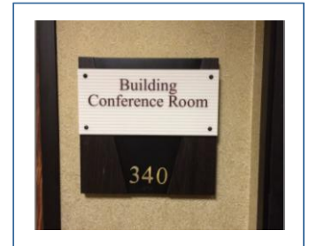
Plaza Center Conference Room Suite 340

Need a Wi-Fi enabled conference room for your next meeting? Plaza Center has made the conference room in suite 340 available to tenants on a first come first served basis. This conference room has space for 12-15 persons and includes Wi-Fi, a sink area and a white board. To reserve suite 340 please contact us at 510-581-5993 or via email at zaballos@zaballos.net . There is no charge for the use of this conference room. Hours of operation are 8AM to 5PM Monday through Friday.