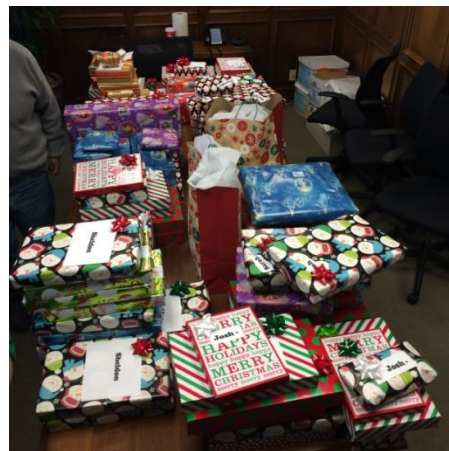
A whole table full of Christmas presents for the kids!