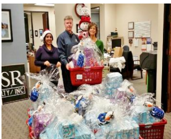
Over the years BSR Realty has helped over 425 families during the holidays.