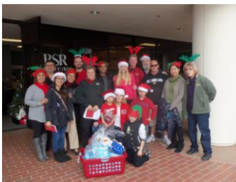
The team at BSR Realty.

Since the creation of the "We Care Project" 21 years ago the families and friends of BSR Realty have enjoyed hand delivering the individually wrapped Christmas baskets full of gifts to each family and have passed on the tradition to their children who now look forward to the "We Care" project each year.